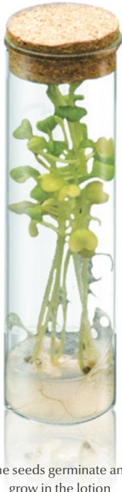
The seeds germinate and grow in the lotion with the Arabian gum.